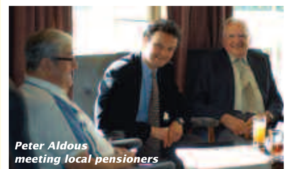
Peter Aldous meeting local pensioners

Peter Aldous comments: "Labour has destroyed one of the strongest pension systems in Europe. As a direct result of Gordon Brown's £5 billion per year raid on pension funds we now have one of Europe's weakest pension provisions." He continued to say: "It is vital that we address this critical issue and provide a better state pension, alongside simplifying the current complicated means-tested arrangements, whilst ensuring people's savings are protected."