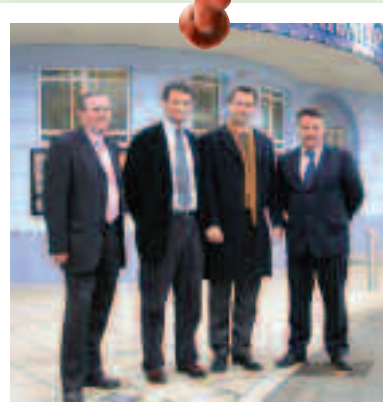
Peter Aldous with Jeremy Hunt MP, Shadow Culture Spokesman